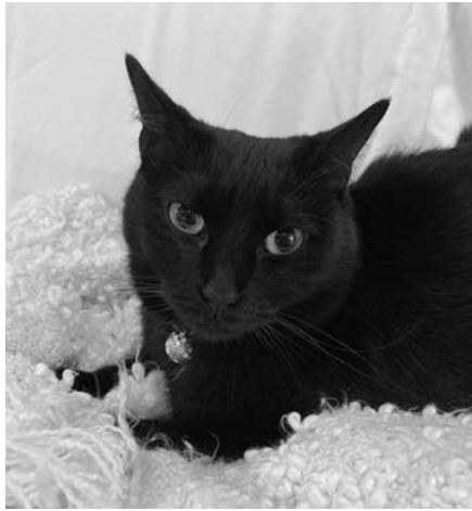
Roro (Rosalina) – A Sweet, Independent Companion Looking for Her Next Home

Due to severe allergies, the family has made the difficult decision to rehome Roro, a 9-year-old, all-black American Shorthair, who has been with the family since she was a 4-month-old kitten. She's spayed, up to date on her vaccinations, and in great health.