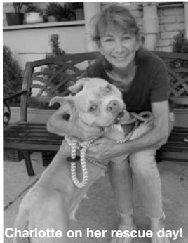
Charlotte on her rescue day!

PUBLISHED BY PAWS, INC. • P.O. BOX 149 • MONTCLAIR, NEW JERSEY 07042 • INFO@PAWSMONTCLAIR.ORG