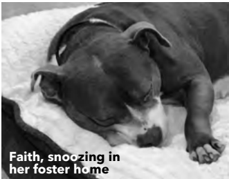
Faith, snoring in her foster home

PUBLISHED BY PAWS, INC. • P.O. BOX 149 • MONTCLAIR, NEW JERSEY 07042 • (973) 746-5212