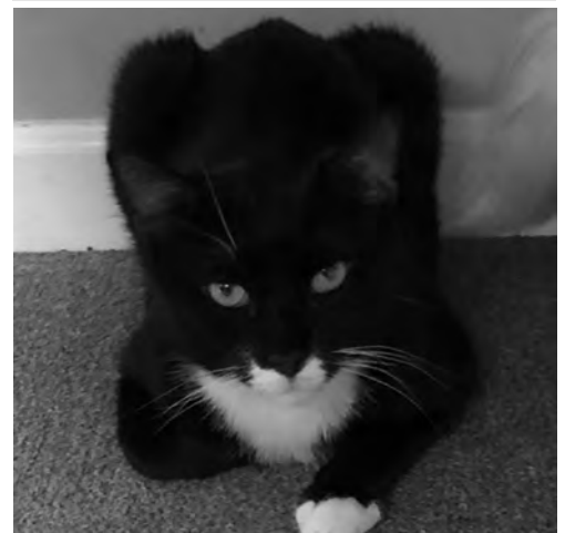
Mo was rescued from bad living conditions and was not a happy cat. He has really come around with the proper care and love but is still shy. Mo is patiently waiting for his forever home to come along soon.